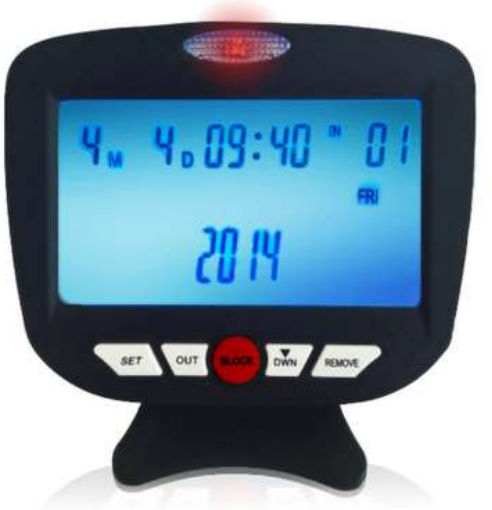
IMPORTANT: CALLER ID SERVICE IS REQUIRED FOR THIS DEVICE TO WORK PROPERLY.